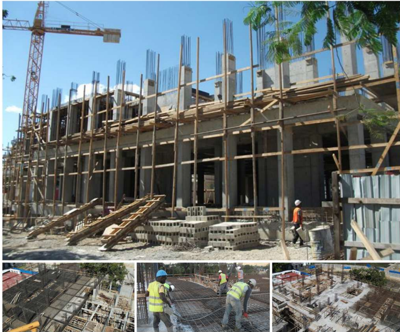
St Michel Hospital