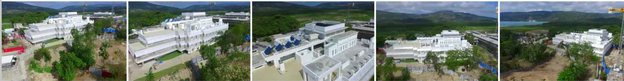
St Michel Hospital