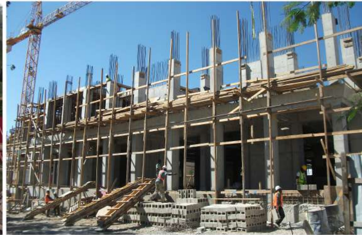
St Michel Hospital