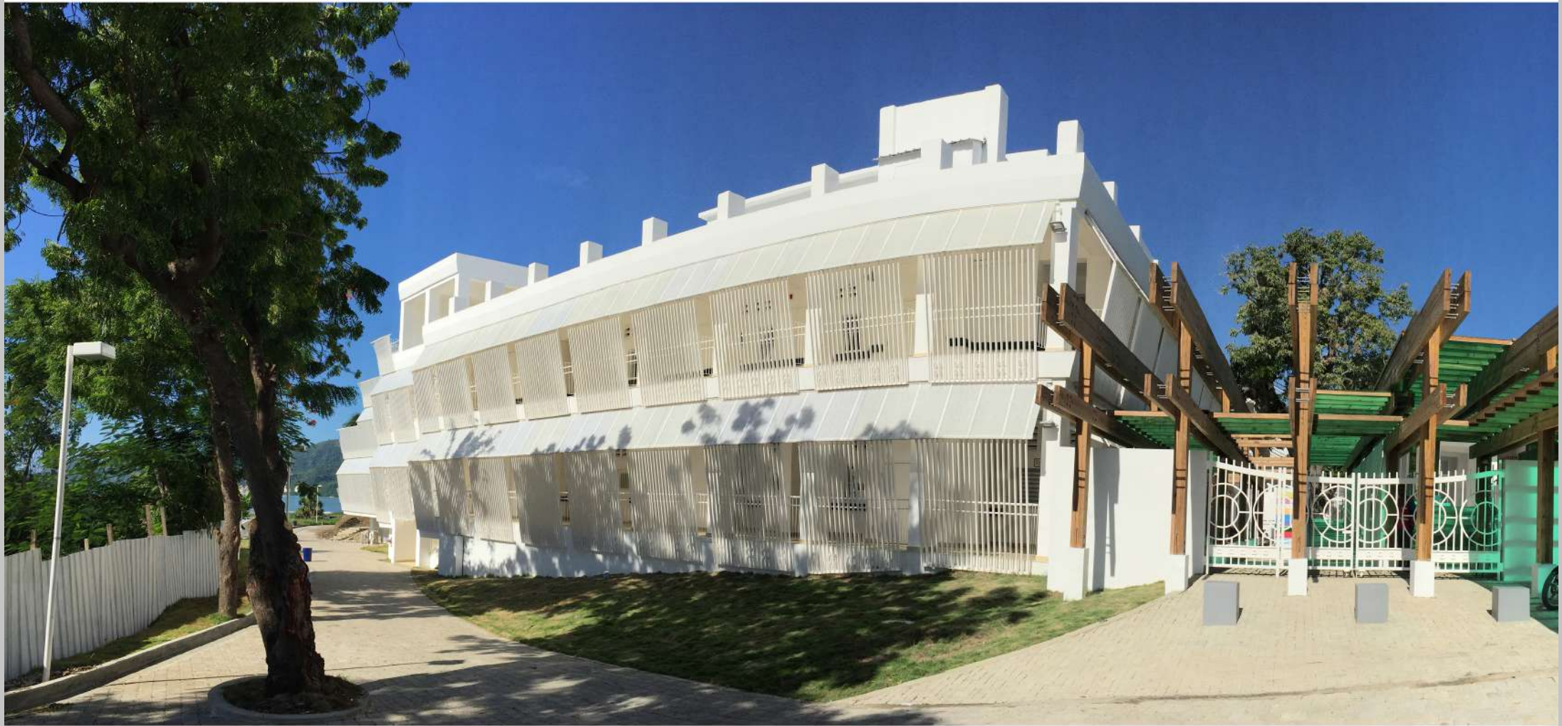
St Michel Hospital