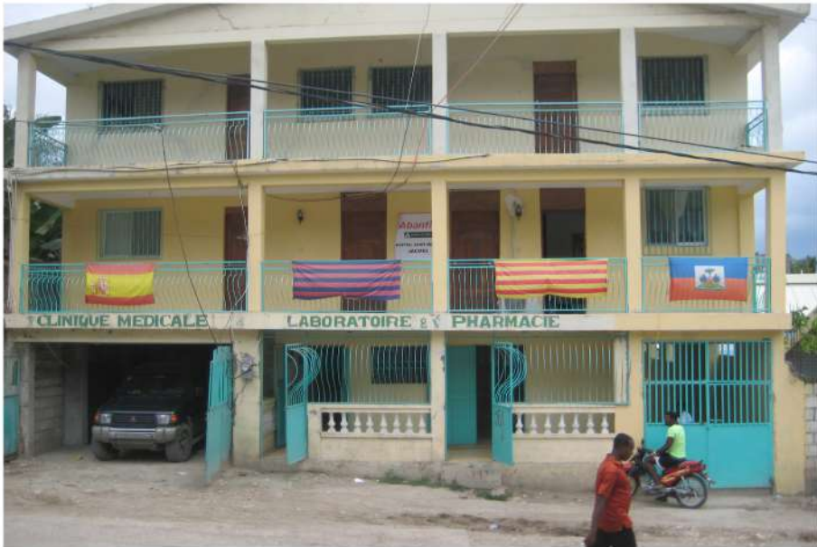
St Michel Hospital