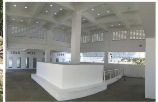
St Michel Hospital