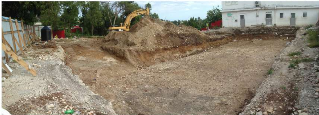
St Michel Hospital