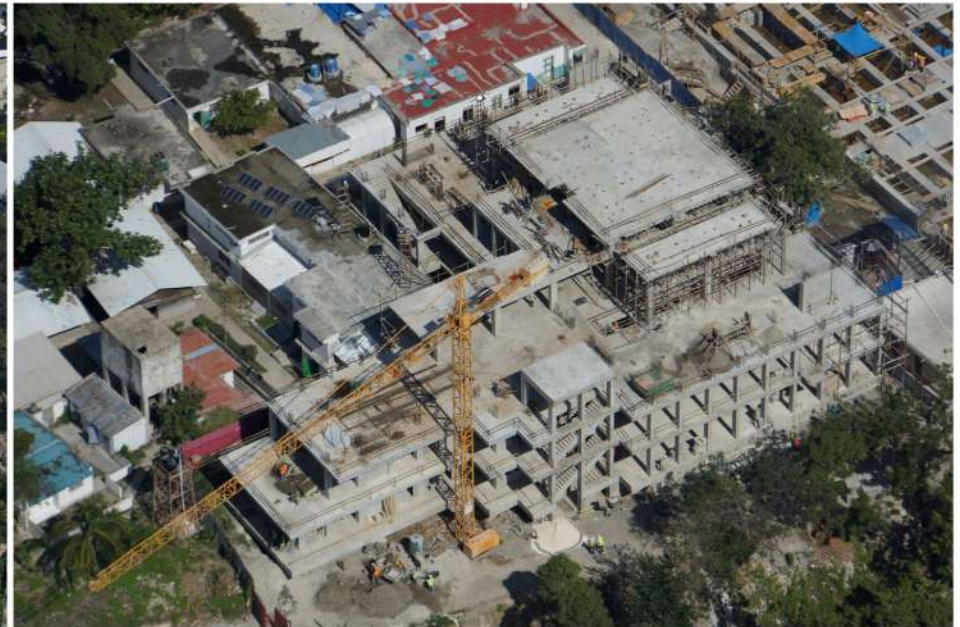
St Michel Hospital