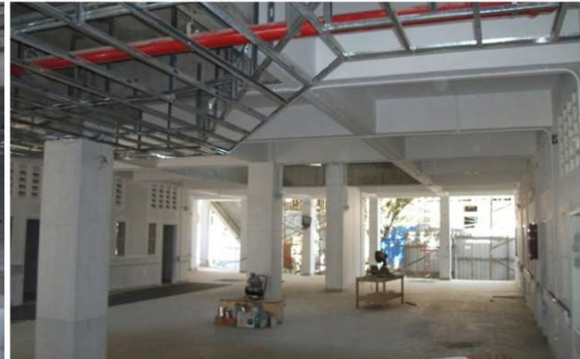
St Michel Hospital