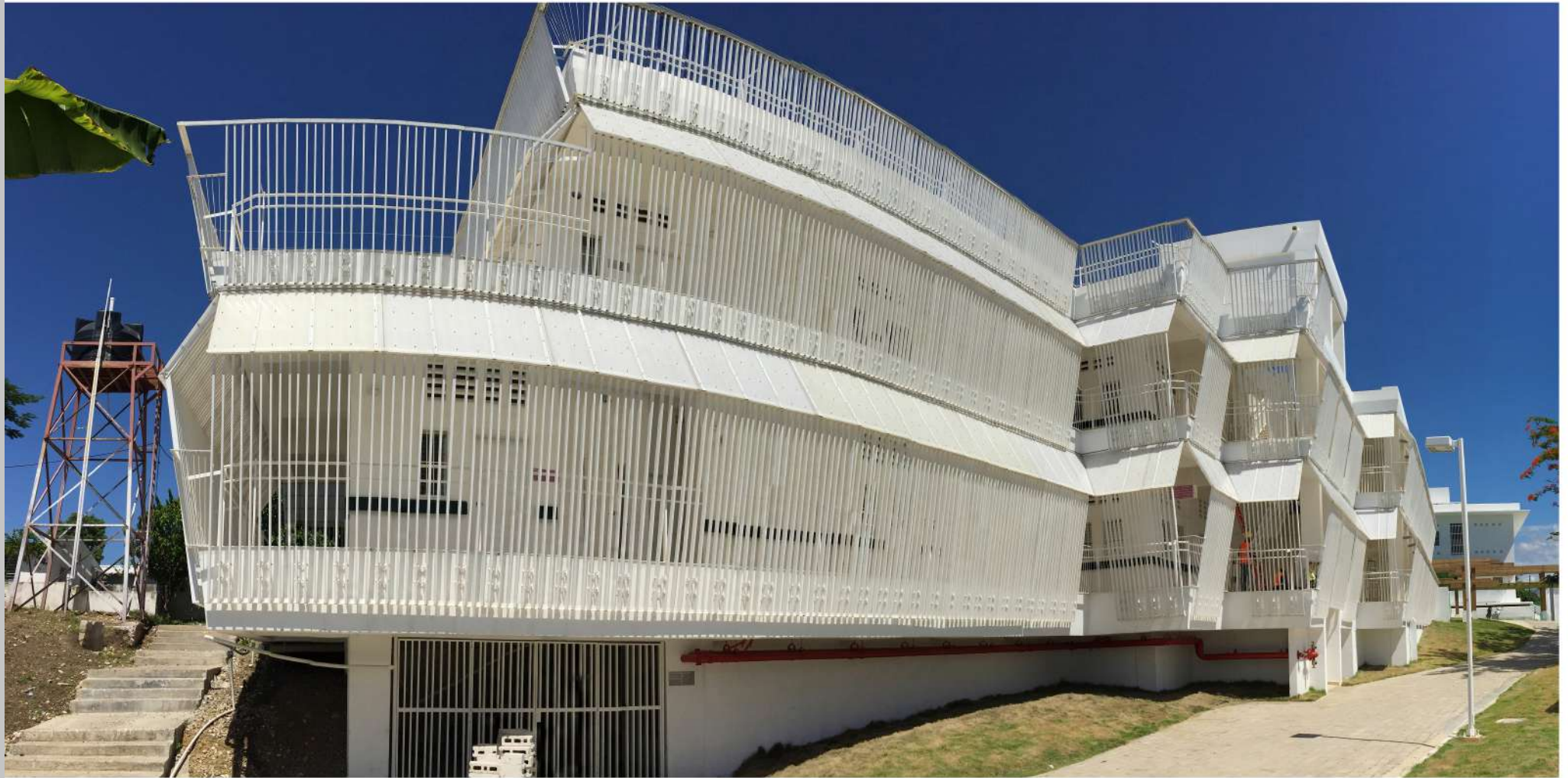
St Michel Hospital