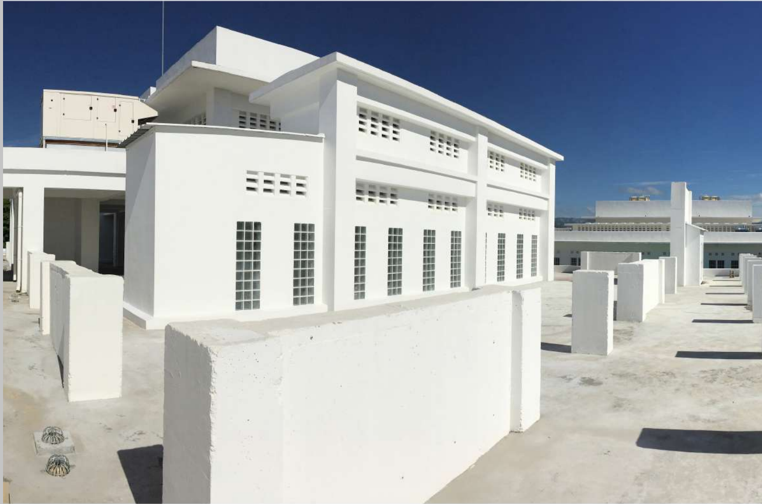
St Michel Hospital