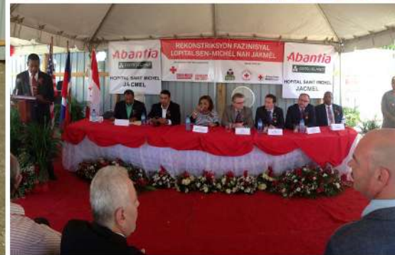
St Michel Hospital Ceremony of laying the Foundation Stone. December 10, 2013