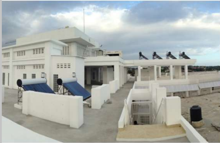
St Michel Hospital